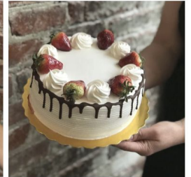
Strawberry Delight From $37.00 CAD