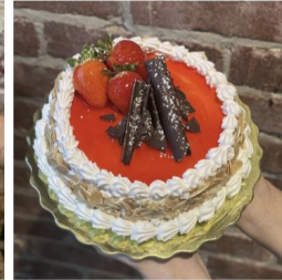
Cheesecake From $33.00 CAD