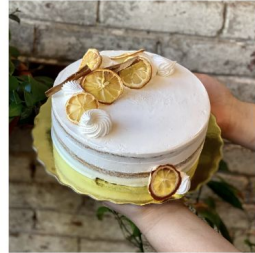
Lemon Custard Cake From $32.00 CAD